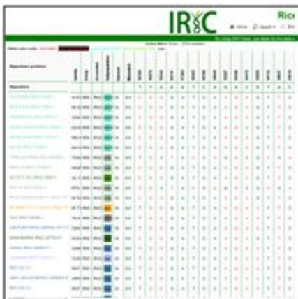
Figure1. BigListBox is used to display large SNP data.